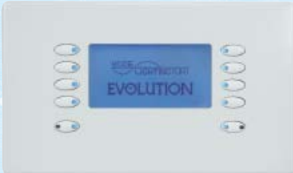
EVO-LCD-55-WHI with EVO-L-WHI-55