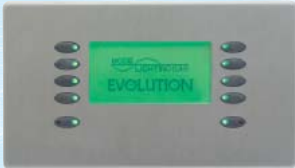
EVO-LCD-55-BLK with EVO-L-BSS-55