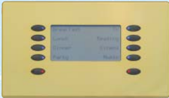
EVO-LCD-55-BLK with EVO-L-PBR-55