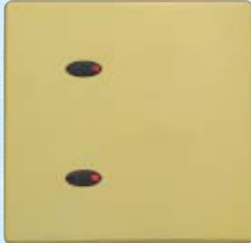
EVO-SGP-55-BLK with EVO-S-PBR-55