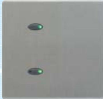
EVO-SGP-55-BLK with EVO-S-BSS-55