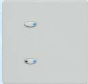
EVO-SGP-55-WHI with EVO-S-WHI-55